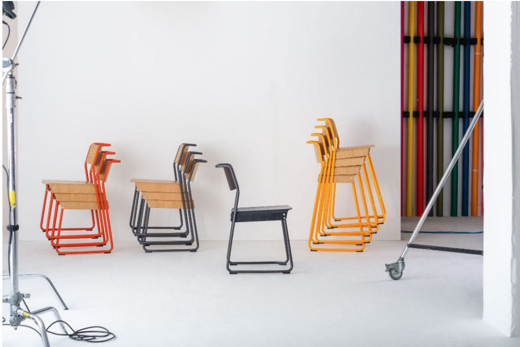
Above: designjunction 2019 exhibitors Very Good & Proper, Canteen Utility Chair & High Stool