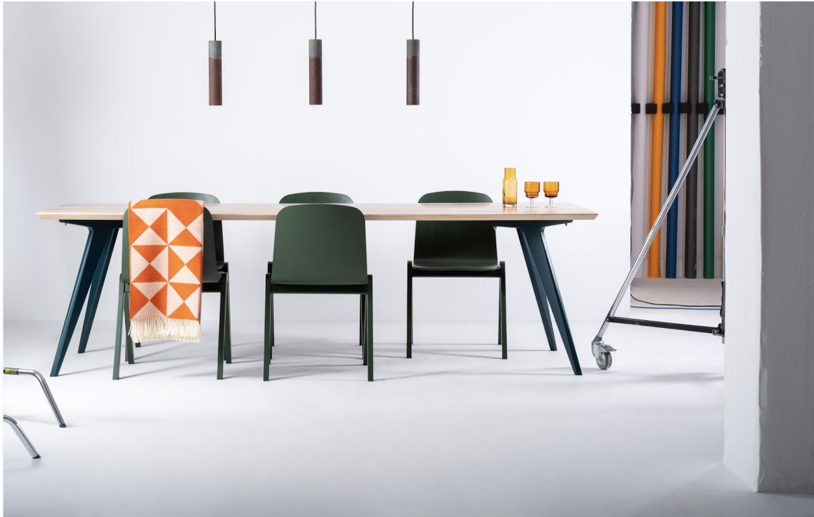
Above: designjunction 2019 exhibitors; Pendant: Pad Home, Roest Vertical Lights, Chairs: Icons of Denmark, Sky Wood in Dark Green, Carafe: LSA International, Utility Vase Amber Glass, Glasses: LSA International, Glass Amber, Table: TedWood, TipToe Table, Throw: Verpan, Mirror Throw Orange