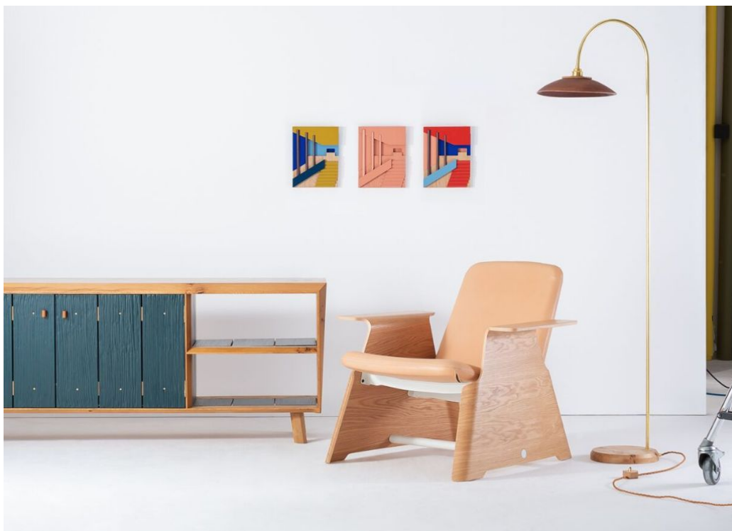
Above: designjunction 2019 exhibitors; Sideboard: TedWood, Folded Sideboard Oak/Petrol,