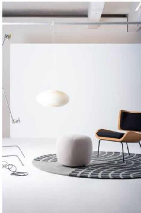
Above: designjunction 2019 exhibitors; Top Left: Moon Pendant, Verpan, Barboy Sidetable, Verpan; Top Right: Knitwit Silver Pendants, Icons of Denmark, Firkant Poufs, Icons of Denmark; Bottom Left: Metal Dowel Shelving, Very Good & Proper, Sled Trays, Very Good & Proper, Baskets, Very Good & Proper, A4 Files, Very Good & Proper, Decanter & Vase, LSA International, Mirror Throw, Verpan, Kant Table, Icons of Denmark, Kevi Chair, Engelbrechts; Bottom Right: Greypants Pendant, Pad Home, Bark Chair in Cork, Icons of Denmark, Firkant Pouf, Icons of Denmark