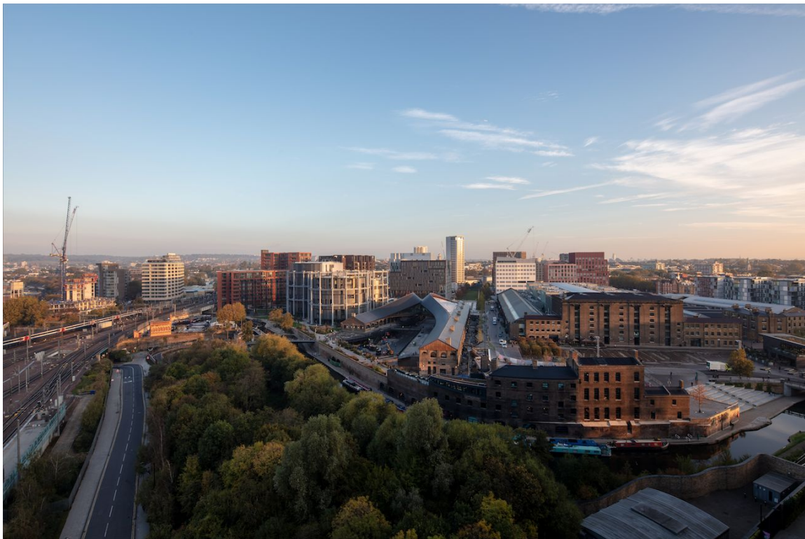
Above: King's Cross will become a Design District for the first time this year

designjunction is delighted to announce its theme for this year's show: (Re)act. Taking place this September, designjunction is excited to be one of the many activations in the area that has led to King's Cross being named as a Design District for the first time.